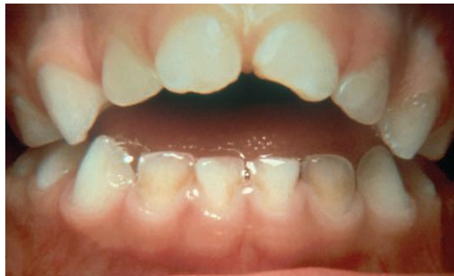
Result of a prolonged sucking habit

Most children stop sucking on thumbs, pacifiers or other objects on their own between 2 and 4 years of age. However, some children continue these habits over long periods of time. In these children, the upper front teeth may tip toward the lip or not come in properly. Frequent or intense habits over a prolonged period of time can affect the way the child's teeth bite together, as well as the growth of the jaws and bones that support the teeth.